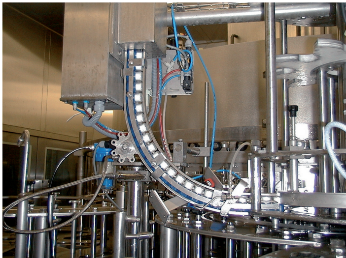
UVATEC used for the disinfection of screw caps in the beverage industry